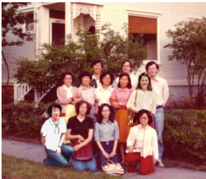
The Calves' Team Missionaries at N.Western Univ. Bible House