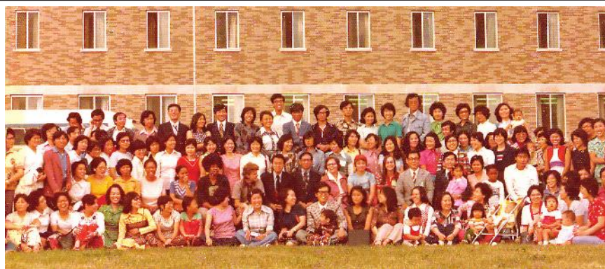
1st Summer Bible Conference at Niagara, 1975